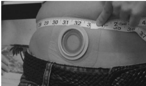
Above the Stoma measures as a 33"