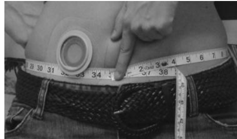
Below the Stoma measures as a 35"

This person would need a 34" Stealth Belt